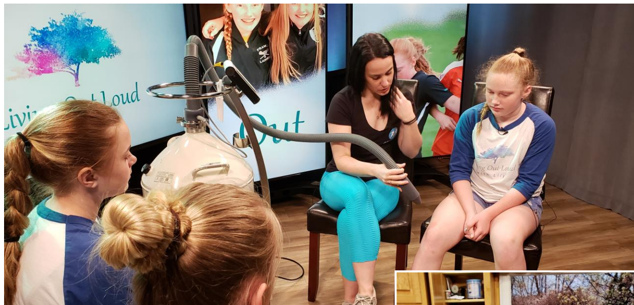
Living Out Loud - Cryoathletic Therapy