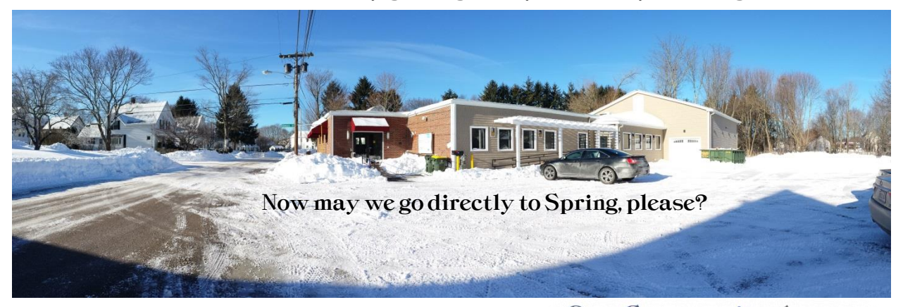
And, thanks for watching!